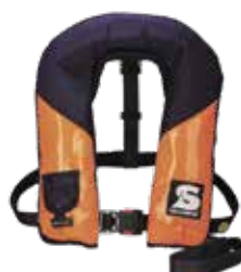
Golf 275 AS (Part Number 13805)

Compatible for use with Secumar Personal Flotation Device models: