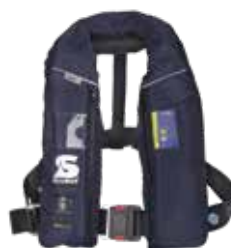
Alpha 275 AS Solas (Part Number 14824-01)